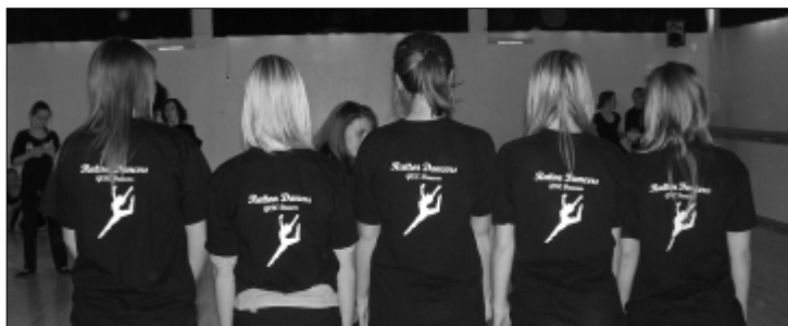
Above - Year 11s sporting their new Dance t-shirts. Right - Year 10s rehearsing for the Dance Evening.

The recent dance evening was a showcase of pieces being worked on by GCSE Dance students in years 10 and 11. The show was a sell out and thoroughly enjoyed by all who attended.