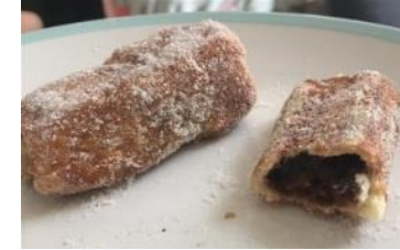
French Toast (Prepared by a pupil from Ratton School as part of a food culture challenge)

Course assessment: Listening, speaking, reading, writing - all assessed by terminal examination, worth 25% each.