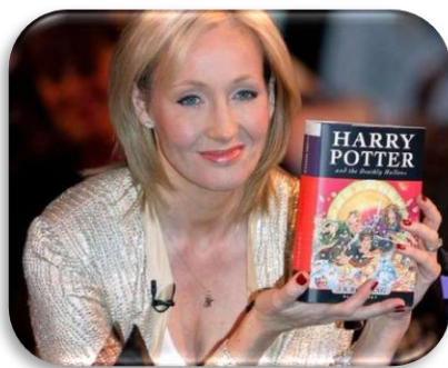
JK Rowling = French and Spanish