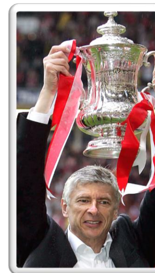
Arsène Wenger = English, Spanish, German