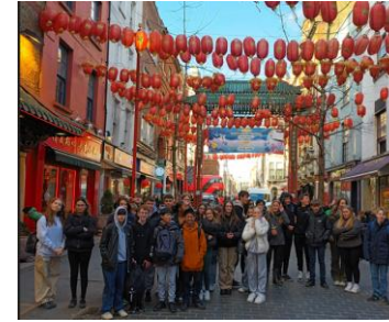
Annual China Town trip – Chinese New Year 2023

Course assessment: Listening, speaking, reading, writing - all assessed by terminal examination, worth 25% each.