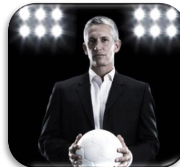
Gary Lineker = Spanish + Japanese