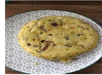
Tortilla Española (Prepared by a pupil from Ratton School as part of a food culture challenge)

Course assessment: Listening, speaking, reading, writing - all assessed by terminal examination, worth 25% each.