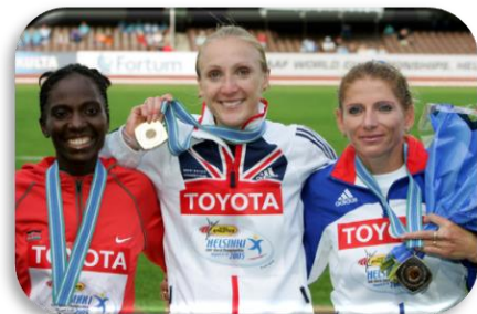
Paula Radcliffe = German and French