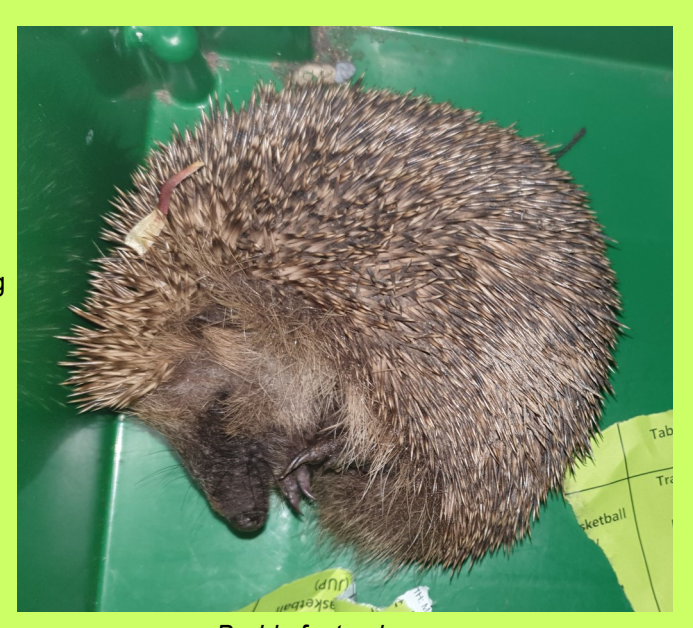
Buddy fast asleep