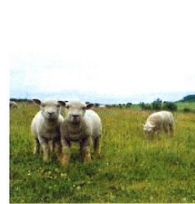
WILDLIFE & NATURE