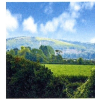
VIEWS & LANDSCAPES