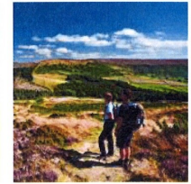
ACTIVITIES & ENJOYMENT

The South Downs Society 'Friends of the South Downs' invite you to enter its photographic competition celebrating the beauty of the South Downs National Park - its landscape, wildlife, buildings and other man-made structures contributing to the cultural heritage of the area. The Park stretches from Eastbourne to Winchester, covering the chalk downs of Sussex and East Hampshire and the sandstone country of the Western Weald. The boundaries of the National Park can be found on our website: www.southdownssociety.org.uk/photo-competition