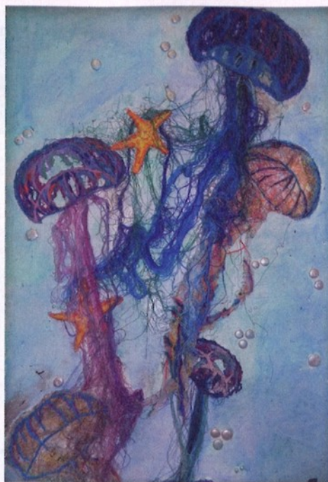
'Jellyfish' Esme Stubbs, 15. Ratton School, Eastbourne. Media: Free machine embroidery, heat treated fabrics and appliqué.