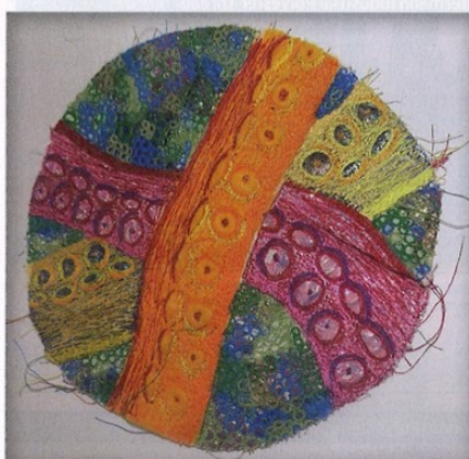
'Tropical Waters' Lyla Tate, 15. Ratton School, Eastbourne. Media: Felt, appliqué and free machine embroidery.