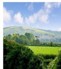
VIEWS & LANDSCAPES