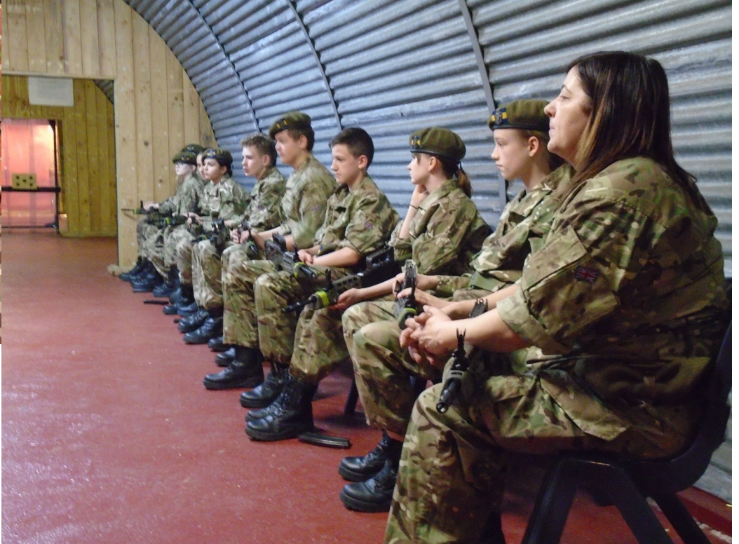
Great work CCF group!