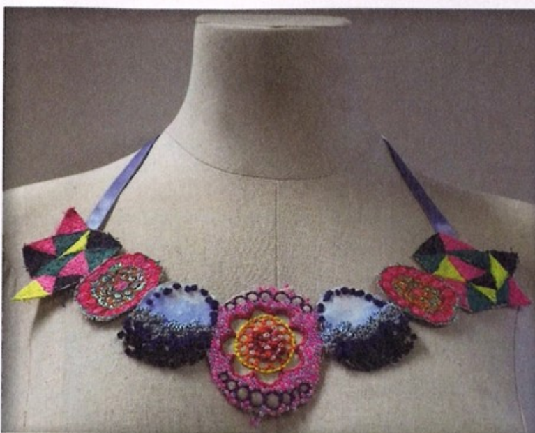
'Old and New' Eloise Tear, 15. Ratton School, Eastbourne. Media: Free machine embroidery and hand embroidery with beaded detail.