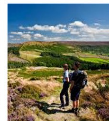
ACTIVITIES & ENJOYMENT

The South Downs Society 'Friends of the South Downs' invite you to enter its photographic competition celebrating the beauty of the South Downs National Park - its landscape, wildlife, buildings and other man-made structures contributing to the cultural heritage of the area. The Park stretches from Eastbourne to Winchester, covering the chalk downs of Sussex and East Hampshire and the sandstone country of the Western Weald. The rules of entry and boundaries of the National Park can be found on our website: www.southdownssociety.org.uk/photo-competition