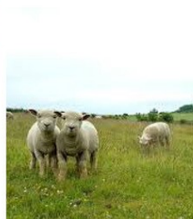
WILDLIFE & NATURE