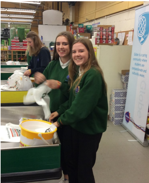
4th November 2016

On Saturday 5th November students from Globe Community raised money for charity by bag packing at ESK in Eastbourne. In 5 hours they raised a fantastic sum of just over £420! Their charity is based in Polegate and is called 'Children with Cancer Fund'. Last year they raised over £1,700 and hope to top that this year.