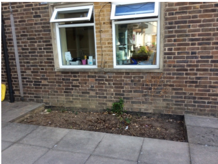
One of the garden beds waiting to be transformed. Watch this space!

By the end of term, the year 9 students will have completed their task and transformed the school entrance. The students have really taken off with this project. The enthusiasm and level of engagement to this task has been a credit to them all. Their hard work and determination through the project will be evident to all students, staff and future guests to Ratton as the new beds will bring a breath of fresh air to the school.